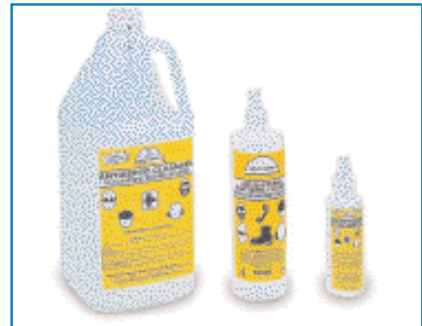
CASTILE SOAP. 50 Sachets/Box 80-0320-0