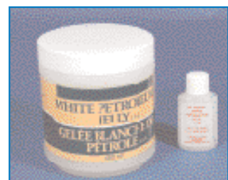
WHITE PETROLEUM JELLY 80-2441-0 17g (5/8 oz) 80-2443-0 460g (16 oz) 80-2444-0 2 Kg. (4.4lbs)