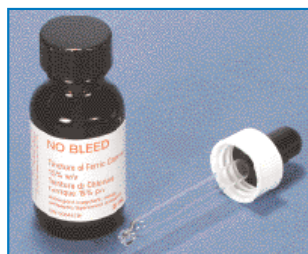
NO BLEED. A mildly antiseptic astringent coagulant for stopping mild bleeding. 80-2469-0 25 ml. bottle