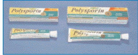
POLYSPORIN ANTIBIOTIC OINTMENT 80-2446-0 15g tube 80-2447-0 30g tube