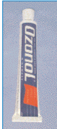
OZONOL ANTISEPTIC OINTMENT For scrapes, cuts, and chafing. Soothes and helps healing. 80-2438-0 1 oz.30gm tube