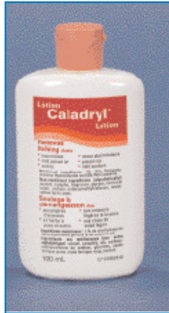
CALADRYL LOTION For the relief of itching caused by minor skin irritations, poison-ivy, and mild sunburn. 80-2465-0 13 oz. (100 ml) Bottle